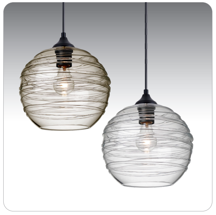
WAVE 10 SHOWN IN SMOKE (462702) & CLEAR (462761)

UL or ETL Listed. Suitable for Damp Locations (exterior use under covered ceiling only).