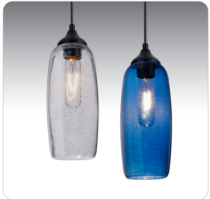
PINOT 9 SHOWN IN CLEAR BUBBLE (PINOT9CL) & BLUE BUBBLE (PINOT9BL)

UL or ETL Listed. Suitable for Damp Locations (exterior use under covered ceiling only).