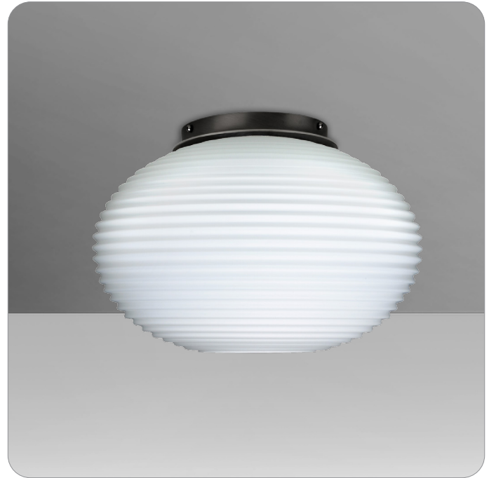
PAPE 10 SHOWN IN OPAL MATTE (491207C)

UL or ETL Listed. Suitable for Damp Locations (interior use only).