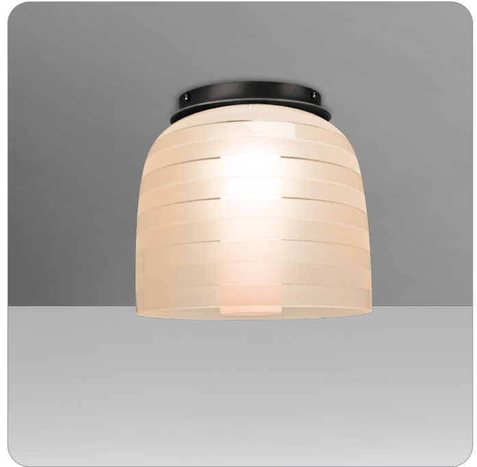
MITZI 7 CEILING SHOWN IN SALMON (MITZI7SAC)

UL or ETL Listed. Suitable for Damp Locations (interior use only).