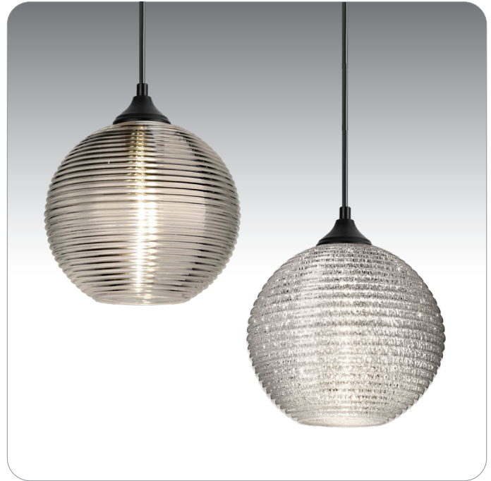
KRISTALL 8 SHOWN IN SMOKE (461602) & GLITTER (4616GL)

UL or ETL Listed. Suitable for Damp Locations (exterior use under covered ceiling only).