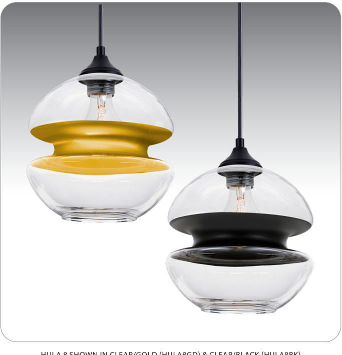
HULA 8 SHOWN IN CLEAR/GOLD (HULA8GD) & CLEAR/BLACK (HULA8BK)