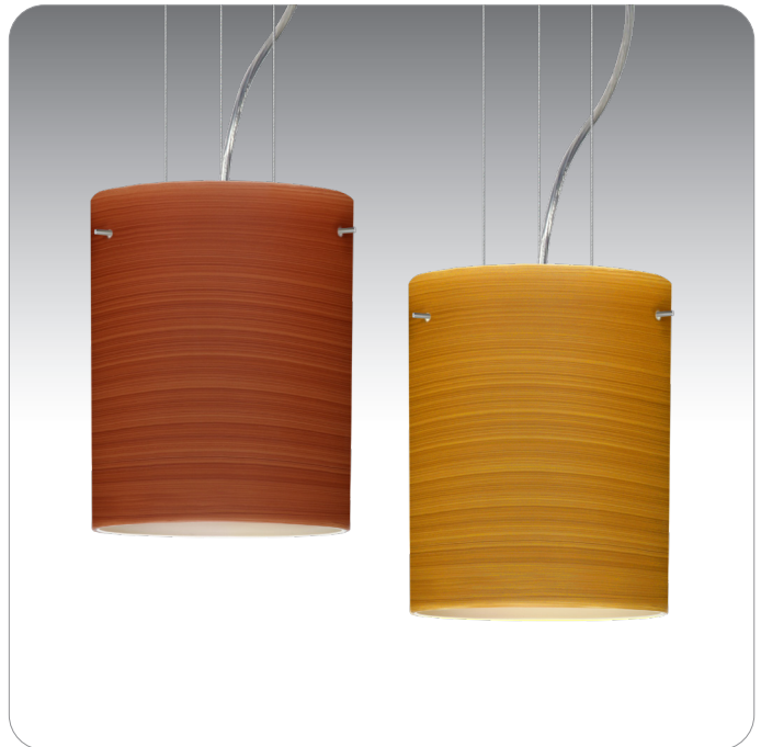
TAMBURO 8 SHOWN IN CHERRY (4006CH) & OAK (4006OK)

Consult factory concerning lower wattage labeling for energy requirements.