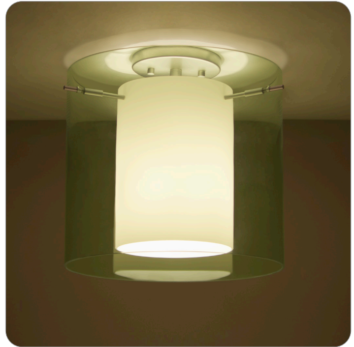
PAHU 12 CEILING SHOWN IN TRANS. OLIVE/OPAL (L18407)

UL or ETL Listed. Suitable for Damp Locations (interior use only).