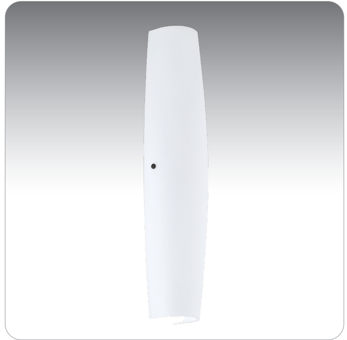
MISTRAL SHOWN IN OPAL MATTE (711207)

UL or ETL Listed. Suitable for Damp Locations (interior use only).