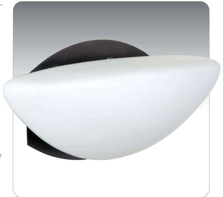
JAMIE SHOWN IN OPAL MATTE (231807) IN BRONZE FINISH

UL or ETL Listed. Suitable for Damp Locations (interior use only).