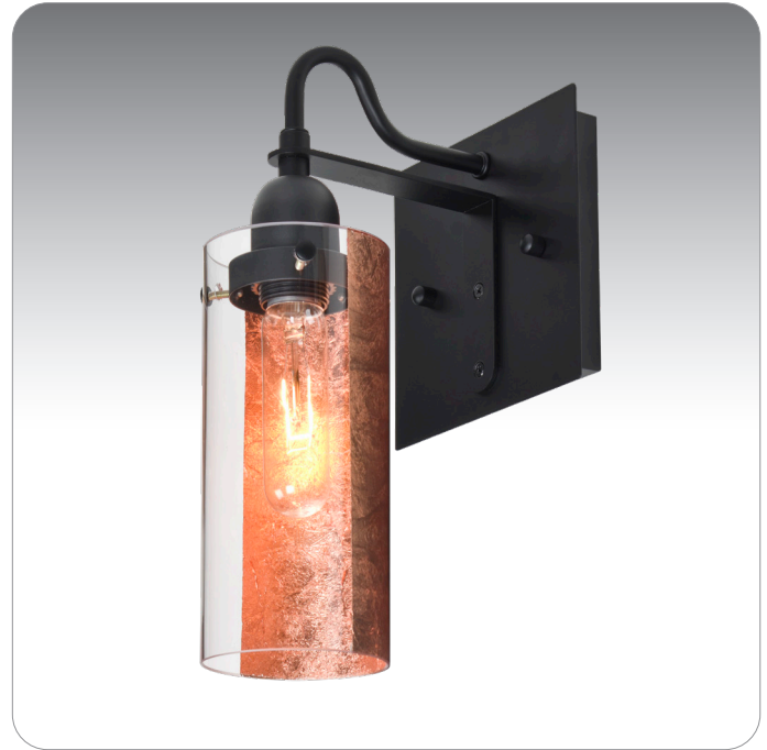
COPPER FOIL (DUKECF)

UL or ETL Listed. Suitable for Damp Locations (interior use only).