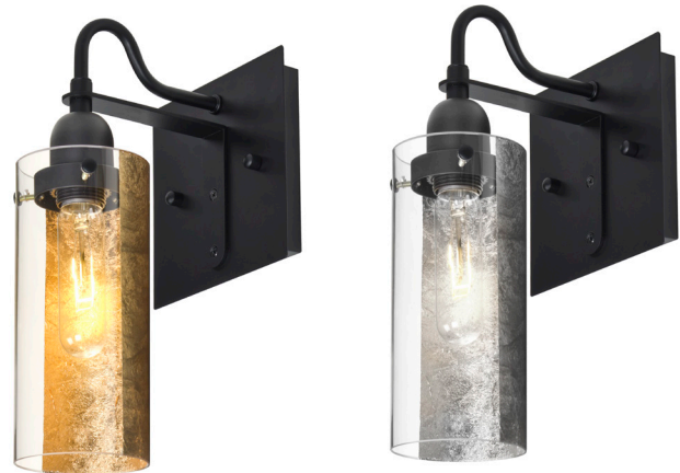
DUKESF SILVER FOIL