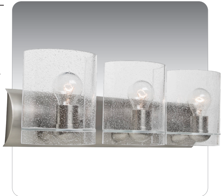
CELTIC SHOWN IN BUBBLE (CELTICBB)

UL or ETL Listed. Suitable for Damp Locations (interior use only).