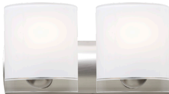
CELTICCL OPAL GLOSSY/CLEAR