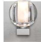
2WF: 14" L