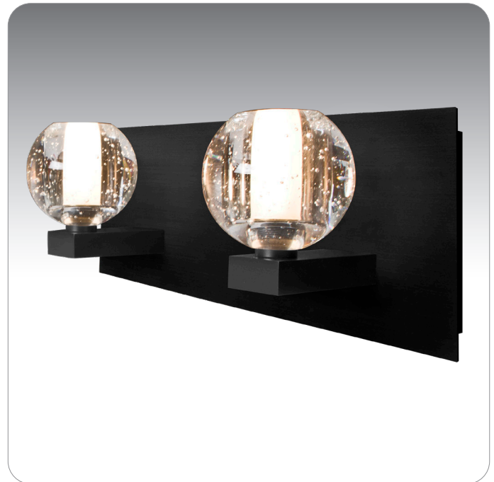
BOCA BUBBLE (BOCABB) IN BRONZE

UL or ETL Listed. Suitable for Damp Locations (interior use only).