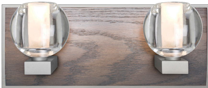
* SHOWN W/ WEATHERED WOOD BACKPLATE (S1004-WW)