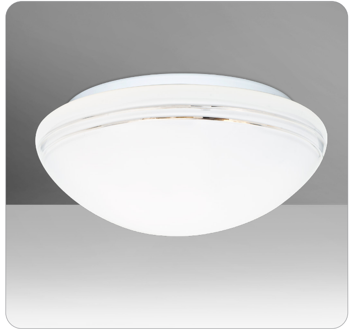
BOBBI CEILING SHOWN IN OPAL CUT

UL or ETL Listed. Suitable for Damp Locations (interior use only).