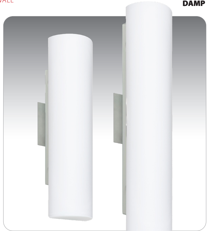
BAAZ 16 SHOWN IN OPAL MATTE (770207) & BAAZ 20 SHOWN IN OPAL MATTE (786007)

UL Listed. Suitable for Damp Locations (interior use only).