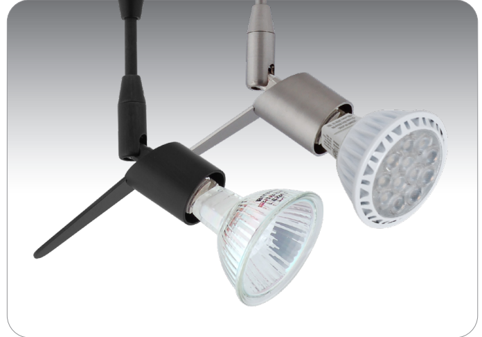
TIPSTER IN BLACK & SATIN NICKEL W/ LED OPTION

UL or ETL Listed. Suitable for Dry Locations (interior use only).