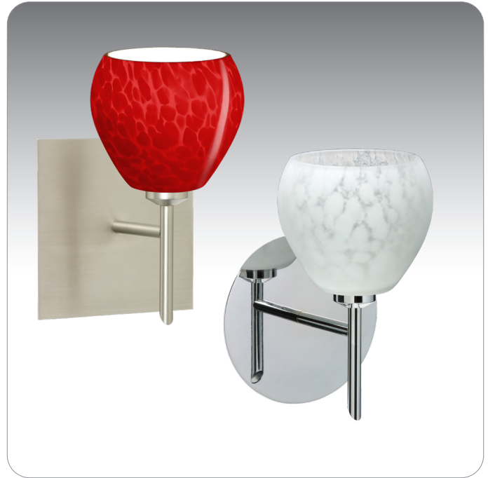
TAY TAY SHOWN IN RED CLOUD (5605RC) WITH SQUARE CANOPY & CARRERA (560519) IN CHROME FINISH

UL or ETL Listed. Suitable for Damp Locations (interior use only).