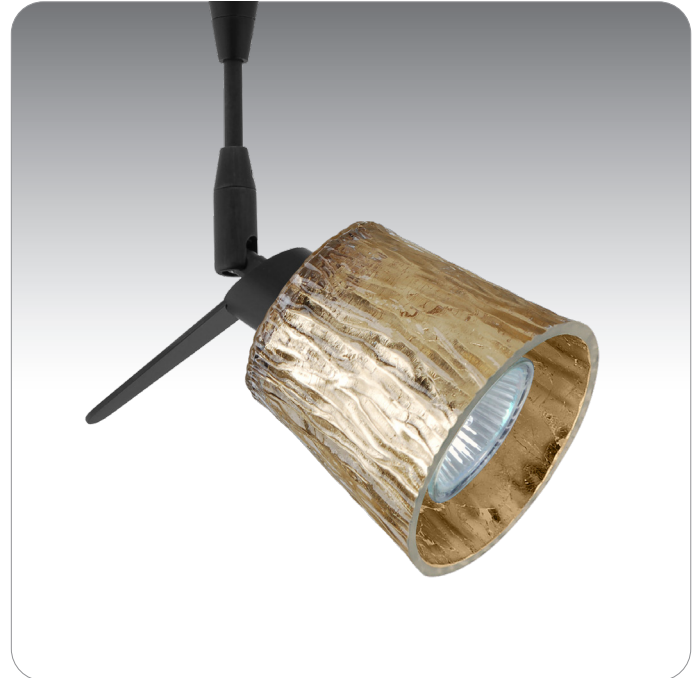
5145GF (STONE GOLD FOIL)

UL or ETL Listed. Suitable for Dry Locations (interior use only).