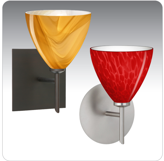
MIA SHOWN IN HONEY (1779HN) & RED CLOUD (1779RC)

UL or ETL Listed. Suitable for Damp Locations (interior use only).