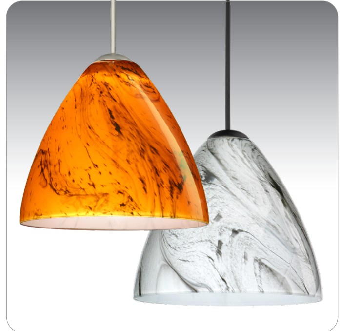
MIA SHOWN IN HABANERO (1779HB) & MARBLE GRIGIO (1779MG) IN BLACK FINISH