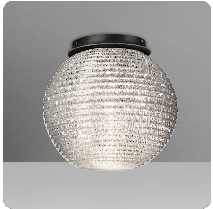
KRISTALL 8 SHOWN IN GLITTER (4616GLC)

UL or ETL Listed. Suitable for Damp Locations (interior use only).