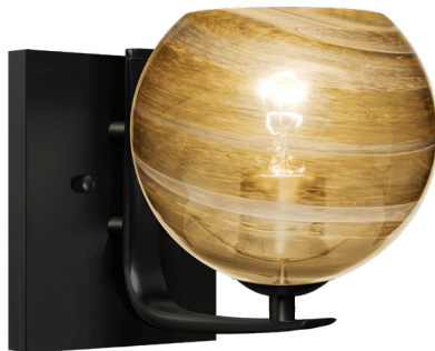
JILLYSM VAPOR SMOKE