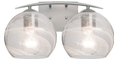
3WC: 25" L