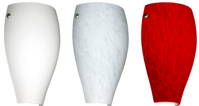
7043RC RED CLOUD