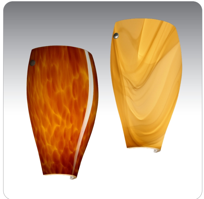
CHELSEA SHOWN IN AMBER CLOUD (704318) & HONEY (7043HN)