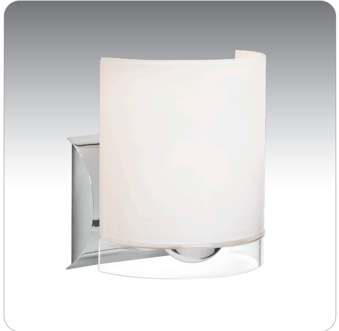
CELTIC SHOWN IN OPAL GLOSSY/CLEAR (CELTICCL) IN CHROME FINISH

UL or ETL Listed. Suitable for Damp Locations (interior use only).