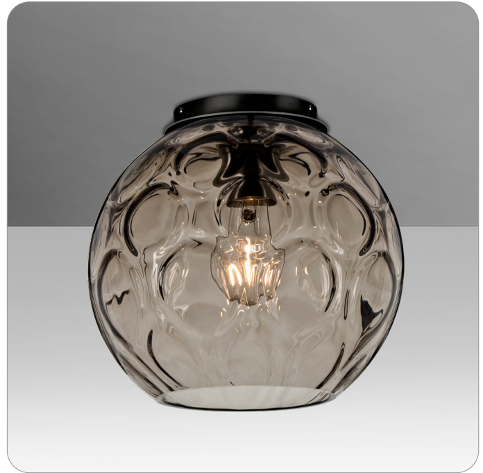
BOMBAY CEILING SHOWN IN SMOKE (BOMBAYSMC)

UL or ETL Listed. Suitable for Damp Locations (interior use only).