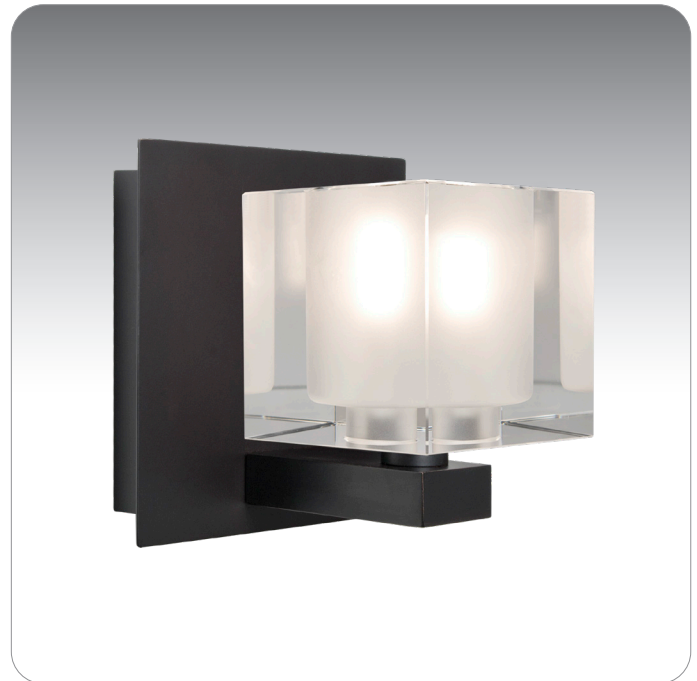
CLEAR/FROST (BOLOFR) IN BRONZE

UL or ETL Listed. Suitable for Damp Locations (interior use only).