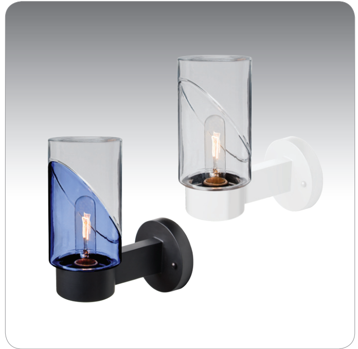
BLINK SHOWN IN BLUE/CLEAR (BLINKBL) & IN CLEAR (BLINKCL)

UL or ETL Listed. Suitable for Wet Locations (interior or exterior use).