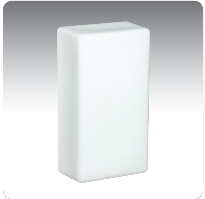
LIDO SHOWN IN OPAL MATTE

UL or ETL Listed. Suitable for Wet Locations (interior or exterior use).