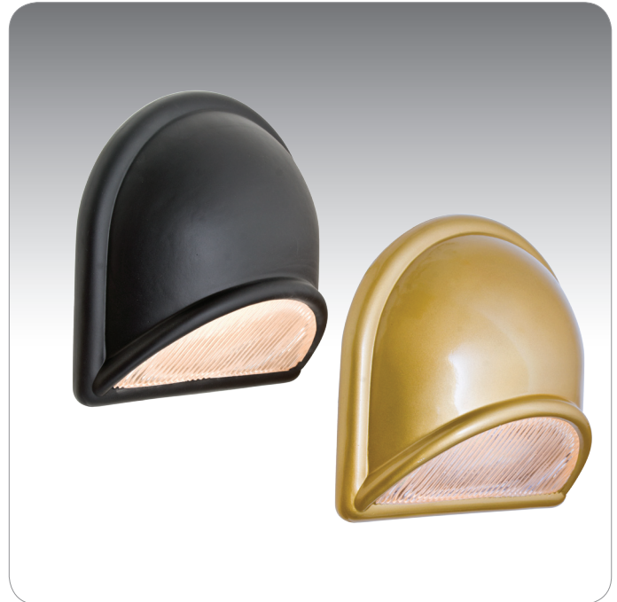
BLACK/CLEAR (GABBYBK) & GOLD/CLEAR (GABBYGD)

UL or ETL Listed. Suitable for Wet Locations (interior or exterior use).