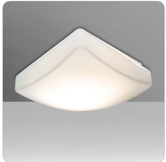
OPAL MATTE (SLOPE11C)

UL or ETL Listed. Suitable for Damp Locations (interior use only).