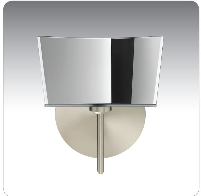
GROOVE SHOWN IN MIRROR (6773MR)

UL or ETL Listed. Suitable for Damp Locations (interior use only).