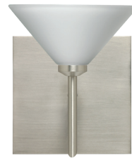
282453 WHITE STARPOINT