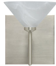
282890 MANGO STARPOINT