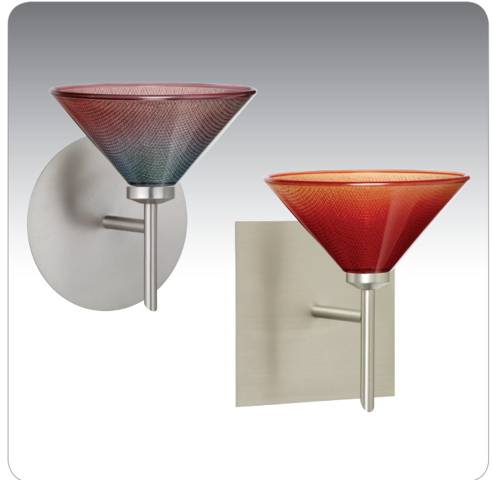
KONA SHOWN IN BICOLOR (117691) & SUNSET (117681) WITH SQUARE CANOPY