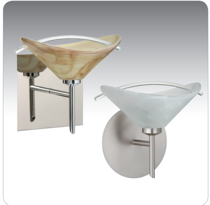
HOPPI SHOWN IN MOCHA/CLEAR (181305) WITH SQUARE CANOPY IN CHROME FINISH & MARBLE/CLEAR (181304)

UL or ETL Listed. Suitable for Damp Locations (interior use only).