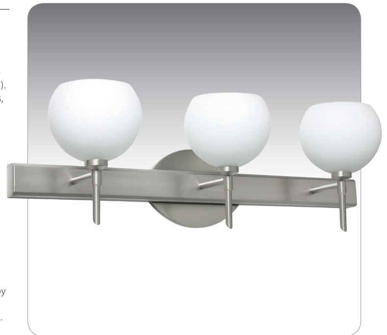
PALLA 5 SHOWN IN OPAL MATTE (565807)

UL or ETL Listed. Suitable for Damp Locations (interior use only).