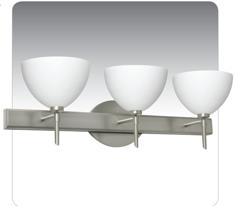
BRELLA SHOWN IN WHITE (467907)

UL or ETL Listed. Suitable for Damp Locations (interior use only).