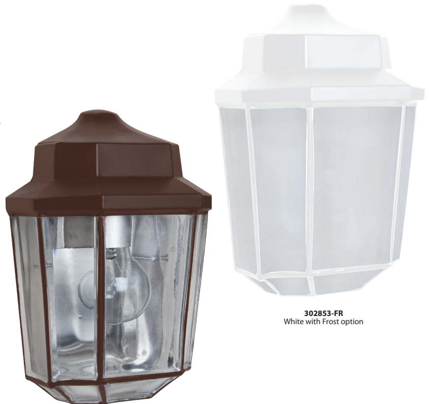
302853-FR White with Frost option

May be used in Interior or Exterior applications.