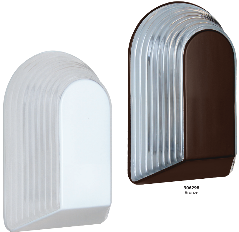
306253-FR White with Frost option