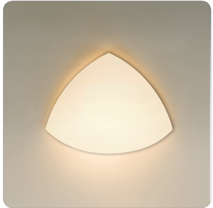
CIRRUS SHOWN IN OPAL MATTE (297107)

UL or ETL Listed. Suitable for Wet Locations (interior or exterior use).