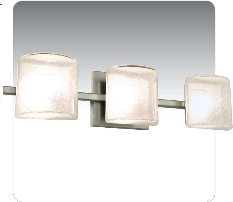
PAOLO SHOWN IN GLITTER (7873GL)

UL or ETL Listed. Suitable for Damp Locations (interior use only).