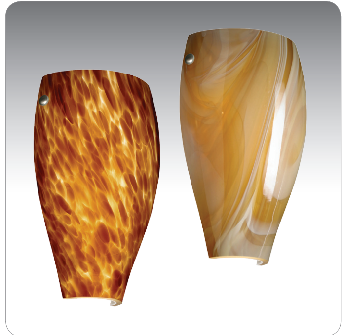
CHELSEA SHOWN IN AMBER CLOUD (704318) & HONEY (7043HN)