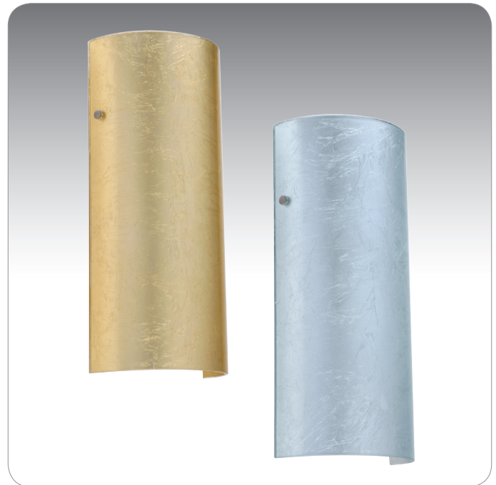
TORRE 14 SHOWN IN COPPER FOIL (8192GF) & SILVER FOIL (8192SF)