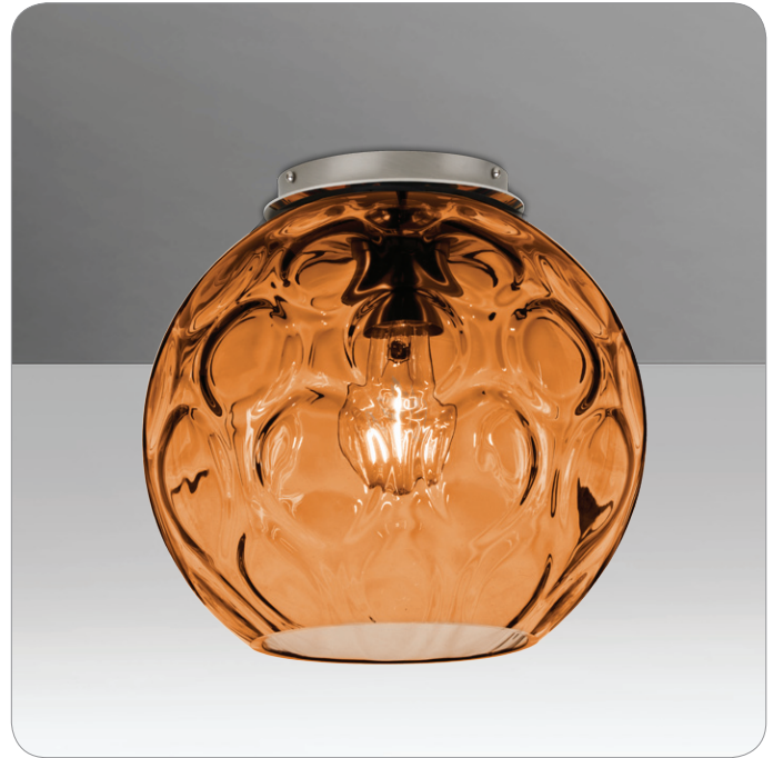
BOMBAY CEILING SHOWN IN AMBER (BOMBAYAMC)

UL or ETL Listed. Suitable for Damp Locations (interior use only).