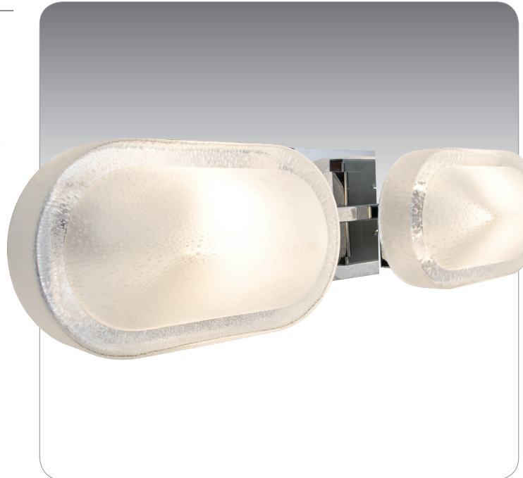
CABO SHOWN IN FROST/BUBBLE (962759)

UL or ETL Listed. Suitable for Damp Locations (interior use only).