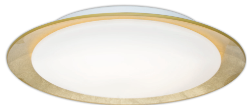
TUCA15GFC OPAL/GOLD FOIL