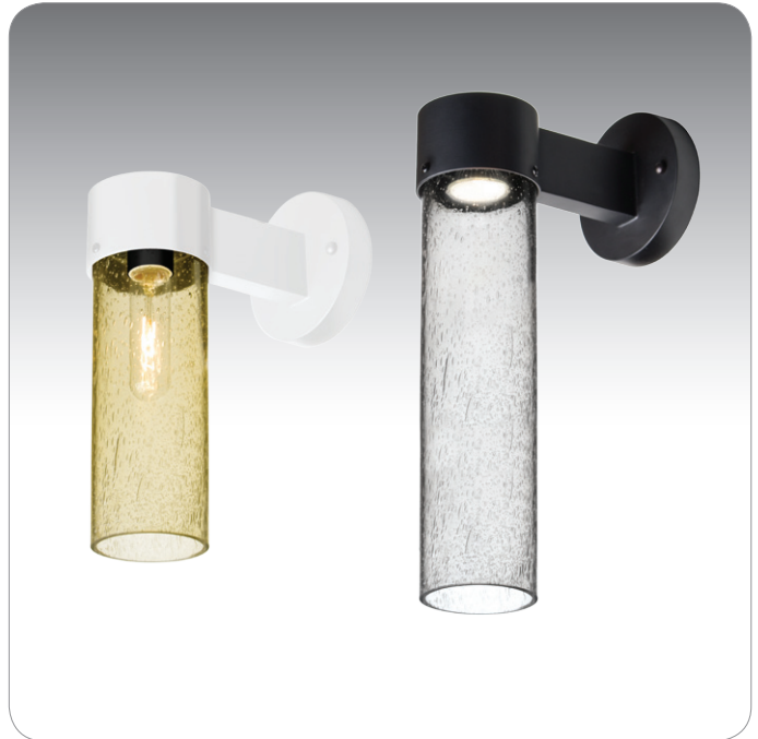
JUNI 10 SHOWN IN GOLD BUBBLE (JUNI10GD) & JUNI 16 SHOWN IN CLEAR BUBBLE (JUNI16CL) WITH LED OPTION

UL or ETL Listed. Suitable for Wet Locations (interior or exterior use).