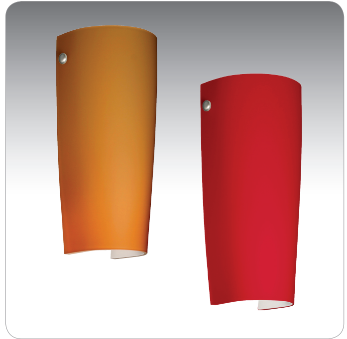
TOMAS SHOWN IN AMBER MATTE (704180) & RUBY MATTE (7041RM)