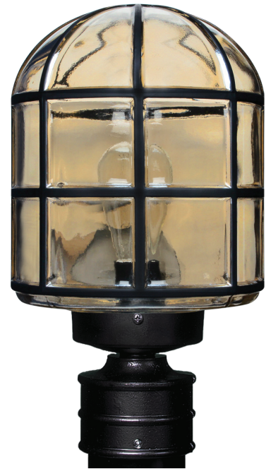
341756-POST Black/Smoke with Post Fitter