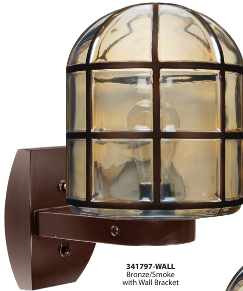
341797-WALL Bronze/Smoke with Wall Bracket

May be used in Interior or Exterior applications.