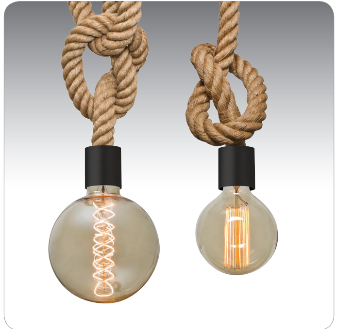
SOLO SHOWN WITH G63 GRAND EDISON (EDI) & G40

UL or ETL Listed. Suitable for Damp Locations (interior use only).