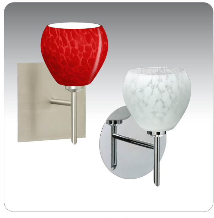
TAY TAY SHOWN IN RED CLOUD (5605RC) WITH SQUARE CANOPY & CARRERA (560519) IN CHROME FINISH