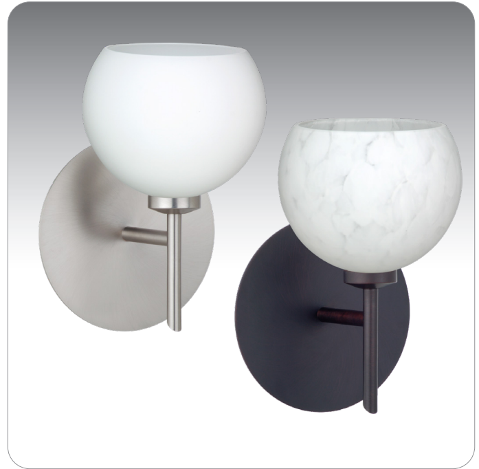
PALLA 5 SHOWN IN OPAL MATTE (565807) & CARRERA (565819) IN BRONZE FINISH

UL or ETL Listed. Suitable for Damp Locations (interior use only).